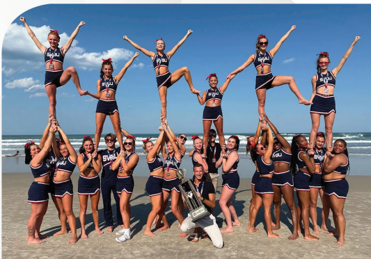
The SVSU club cheer team made school history by capturing second place in the D2 Intermediate Small Coed Division at the 2025 NCA College Nationals, stepping up from their third-place finish in the same category in 2024.