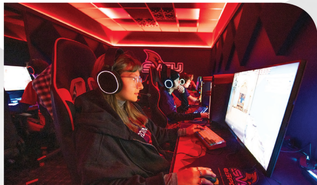
SVSU Esports club team's 2025 major competitions include the Smash Ultimate Open ($5K prize pool), Collegiate Rocket League Invitational ($10K prize pool), Mario Kart World Open and the Youth Fortnite Battle Royale Tournament (scholarships & prizes).