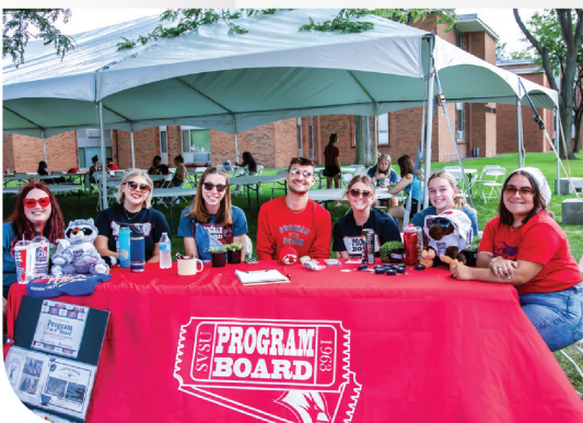
The Program Board is a student-run organization providing free events on campus to all students!