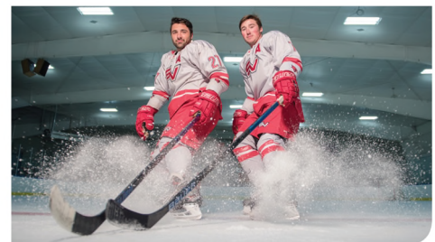
Saginaw Valley club hockey players compete in the American Collegiate Hockey Association and prepare for competitions throughout the year at the nearby Saginaw Bay Ice Arena.