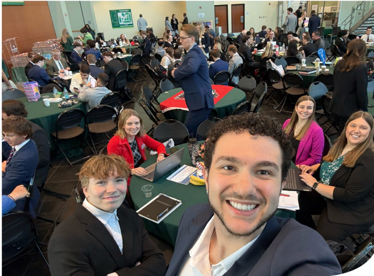
SVSU's Sales Club has celebrated victories at the SVSU Regional Sales Competition in 2023 and 2024 and at the Selling with the Bulls Competition in 2025.