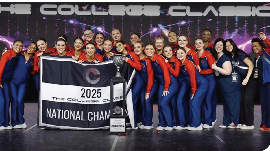
The SVSU dance team achieved historic success at the 2024 Dance Team Union (DTU) College Classic in Orlando, Florida, securing national titles in both the Division II Team Performance and Pom Performance categories. In 2025, the team placed second in both the Team Performance and Spirit Showdown categories.